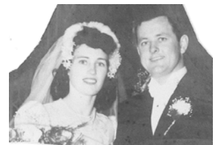
Wedding Day, 6.47