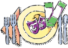
Boca Christians Eating Out

B.C.E.O. ( Boca Christians Eating Out ) will resume this Thursday, September 9th and every Thursday at 6:30 p.m. for dinner and conversation. This week's dinner out will be at J. Marks in Pompano Beach.