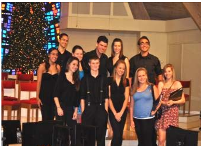
West Boca High School Vanguard and soloists