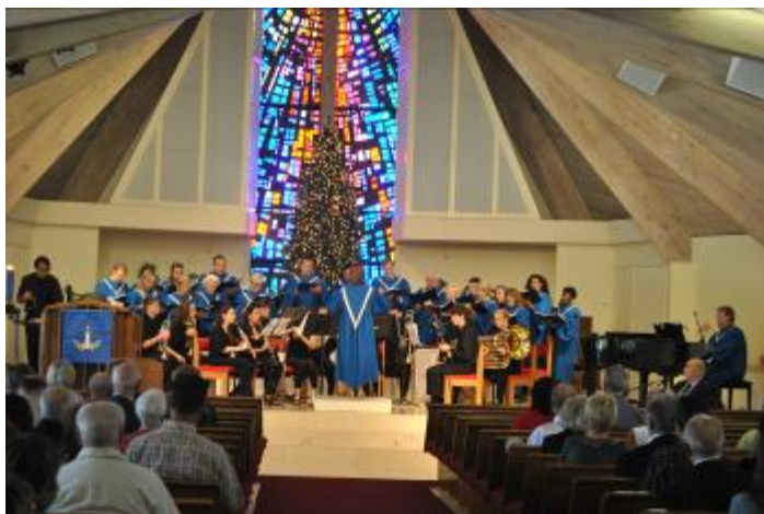
A fabulous cantata!