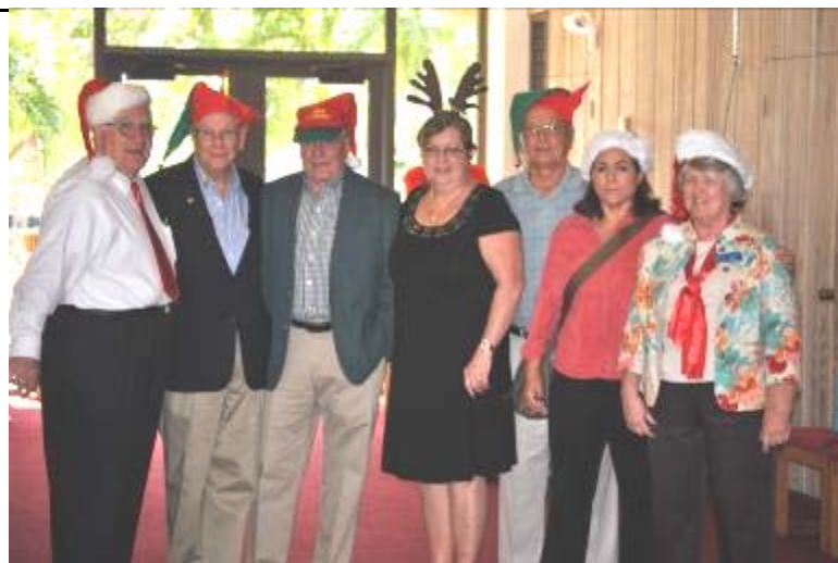
Some of our volunteer elves who participated in a day of service at Boca Helping Hands.